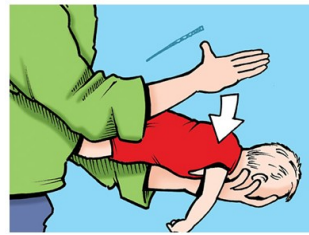
Back Slaps—Picture by RLSS UK.

Now give UP TO 5 back slaps. Using the heel of your hand, slap the baby's back between the