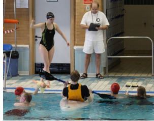
BULSCA Student Nationals 2009, Burgess Hill.

Following the Branch AGM, the role of Branch Competitions Secretary was unfilled. The Branch Committee are looking to co-opt a member of the Branch into this role until the next AGM in 2011. The Competitions Secretary will assist in running the West Region Heat of the National